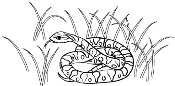
The snake moves through the grass.