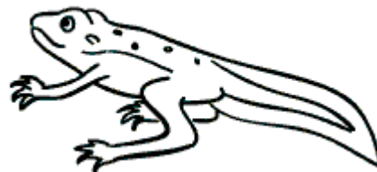
Tadpole changing into an adult frog